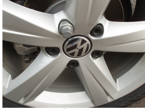
Step 2 Remove Lug bolt and replace with locking lug bolt. Torque wheel bolt to 140 NM.