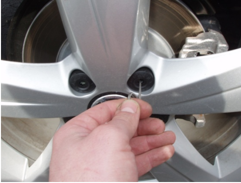
Step 1 Remove lug bolt cap.