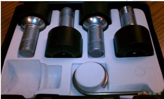
Step 5 Place old lug bolts, caps, cap removal tool back in box.