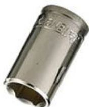
17 mm socket