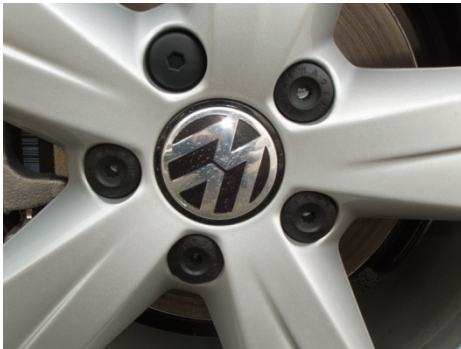
Step 3 Install new lug bolt cap provided with wheel locks set.