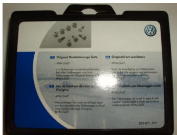
Wheel lock set 000 071 597