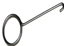
Lug cap removal tool